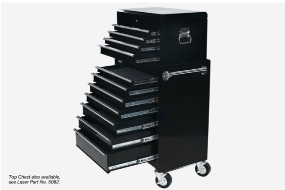
Top Chest also available, see Laser Part No. 5082.