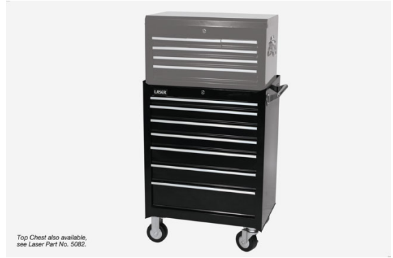
Top Chest also available, see Laser Part No. 5082.